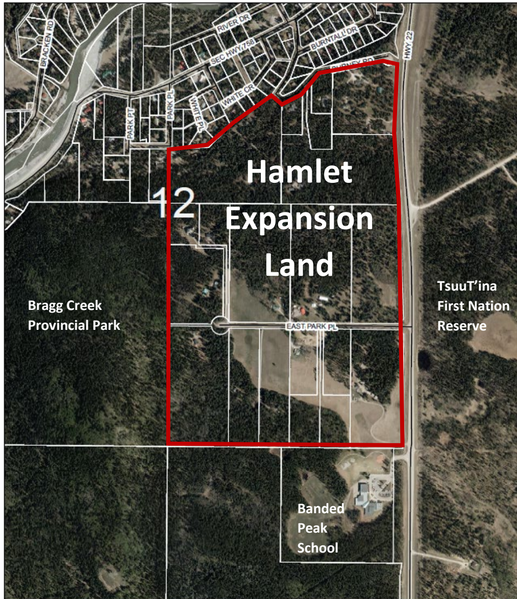
Figure 2 – Hamlet Expansion Land 2018 Aerial Photo