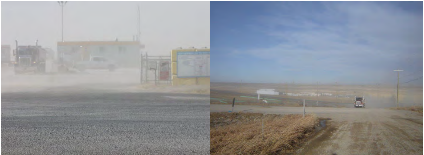
Bearspaw Christian School