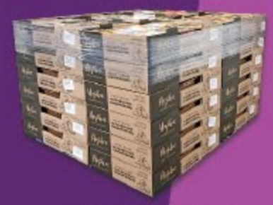
900 pallets are shipped