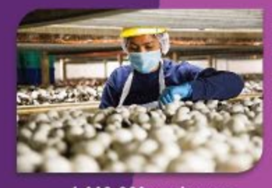
4,000,000 mushrooms are hand picked