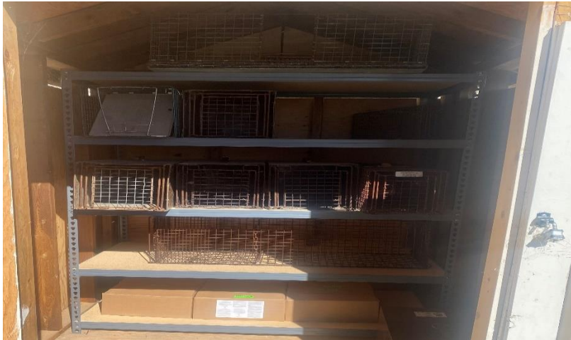
Figure 11 Rental trap storage