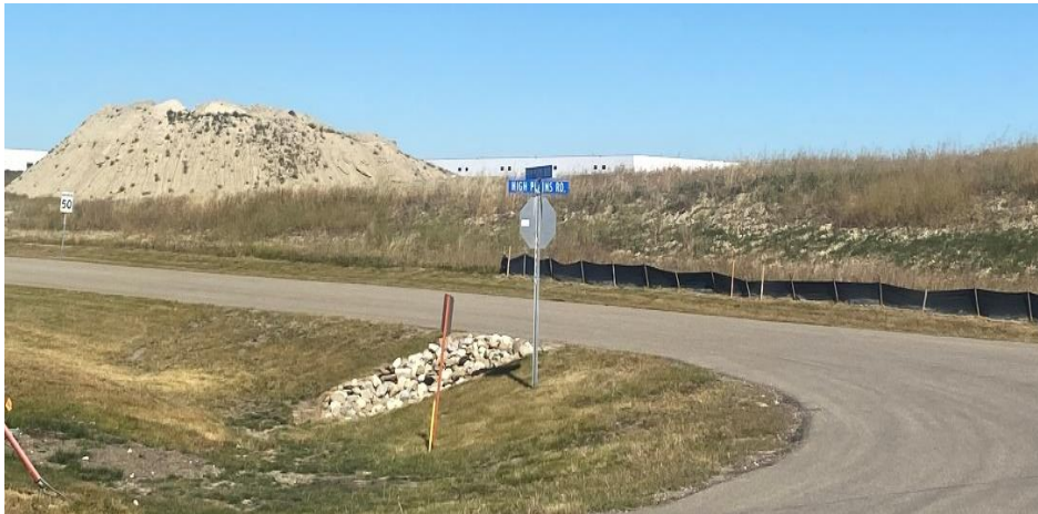
Figure 12 Topsoil project