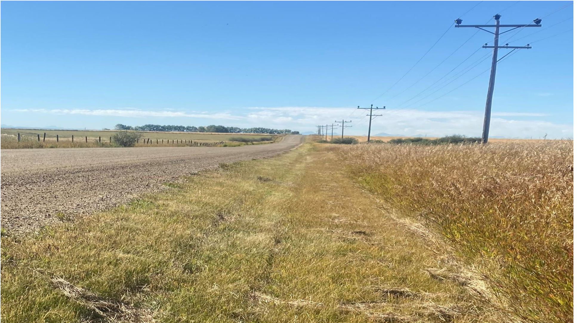
Figure 8 Roadside mowing