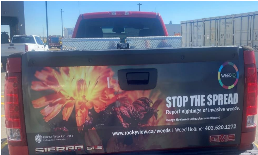
Figure 2 Invasive weed reporting