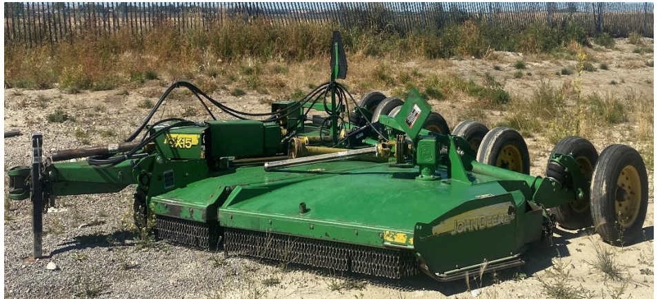
Figure 7 Mower