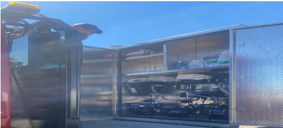
Figure 6 Truck chemical storage and controls