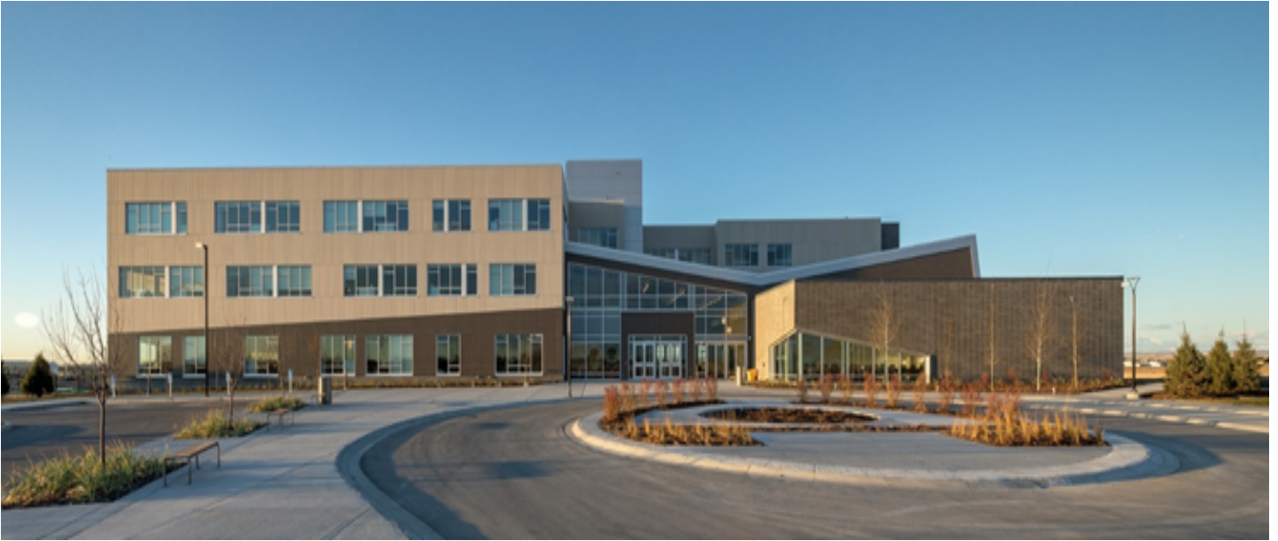
Figure 1 Rocky View County Building