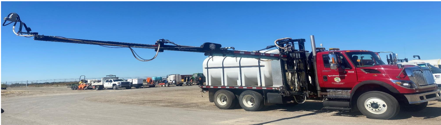
Figure 4 Weed spray boom on truck