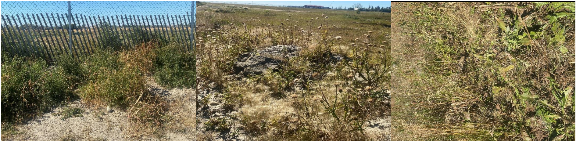
Figure 10 Weed control