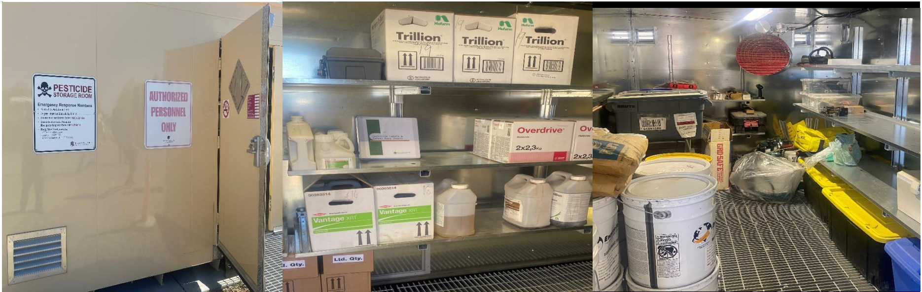
Figure 9 Secure chemical and pesticide storages