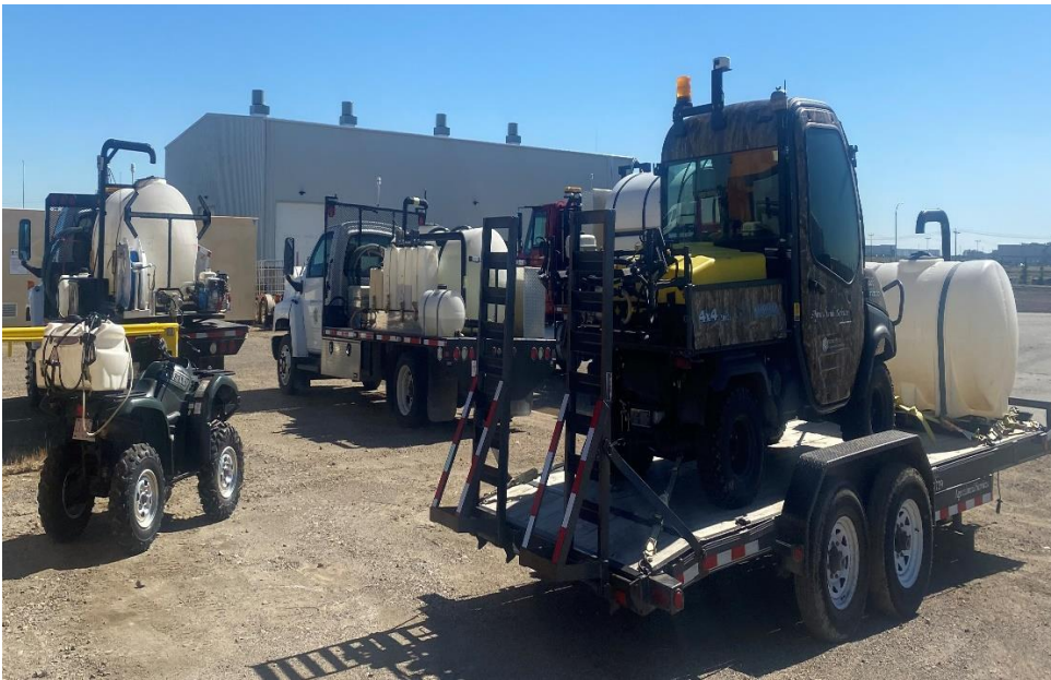
Figure 5 Chemical spray tank vehicles