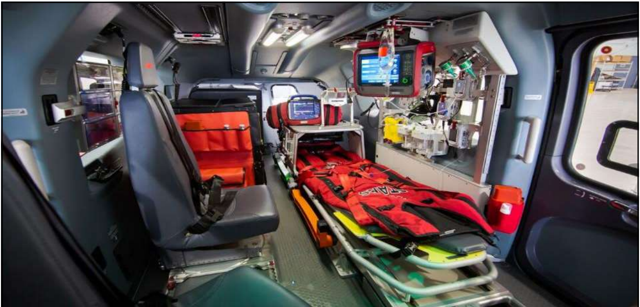
AIRBUS H145 – AIRBORNE INTENSIVE CARE UNIT (ICU)