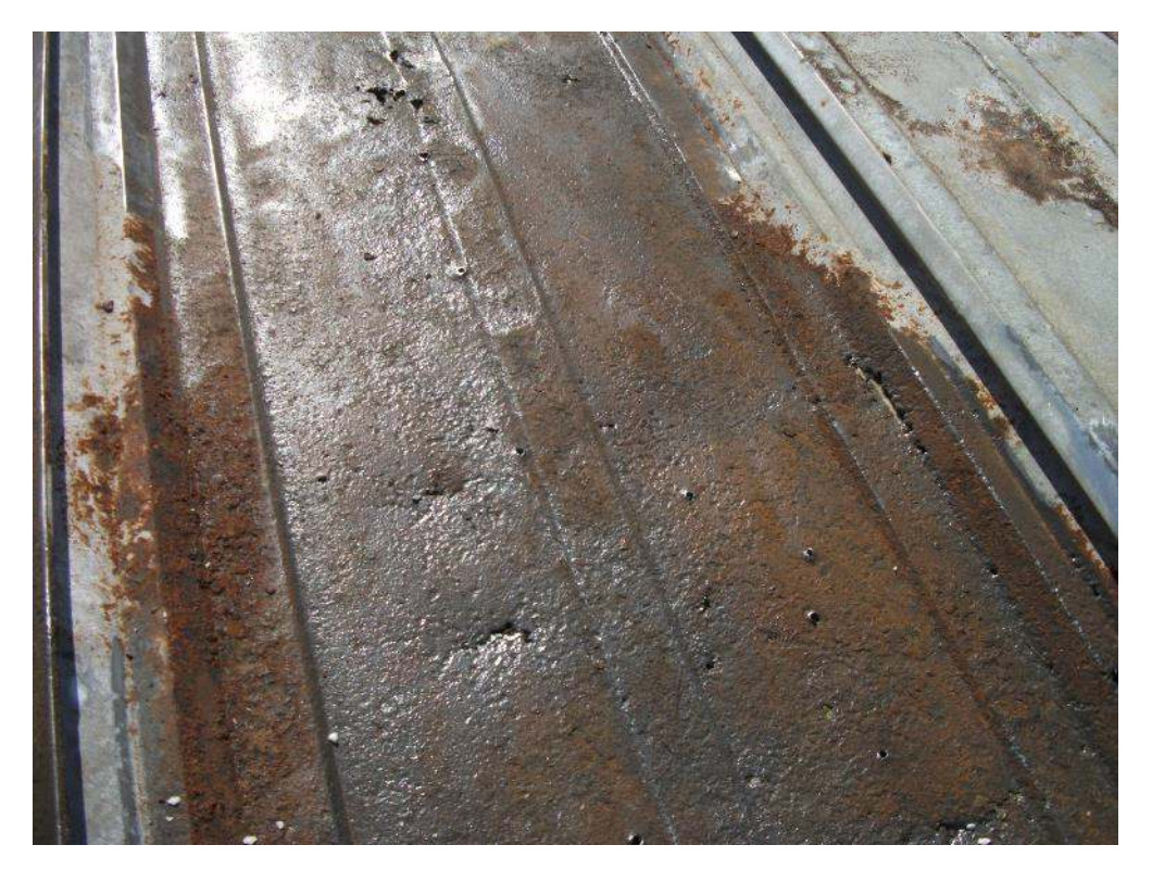
Photograph # 8: Corrosion through seams