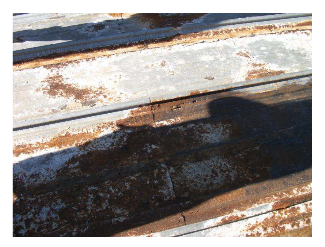
Photograph # 5: Overall view