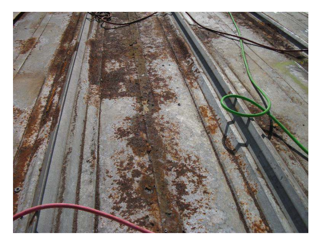
Photograph # 11: