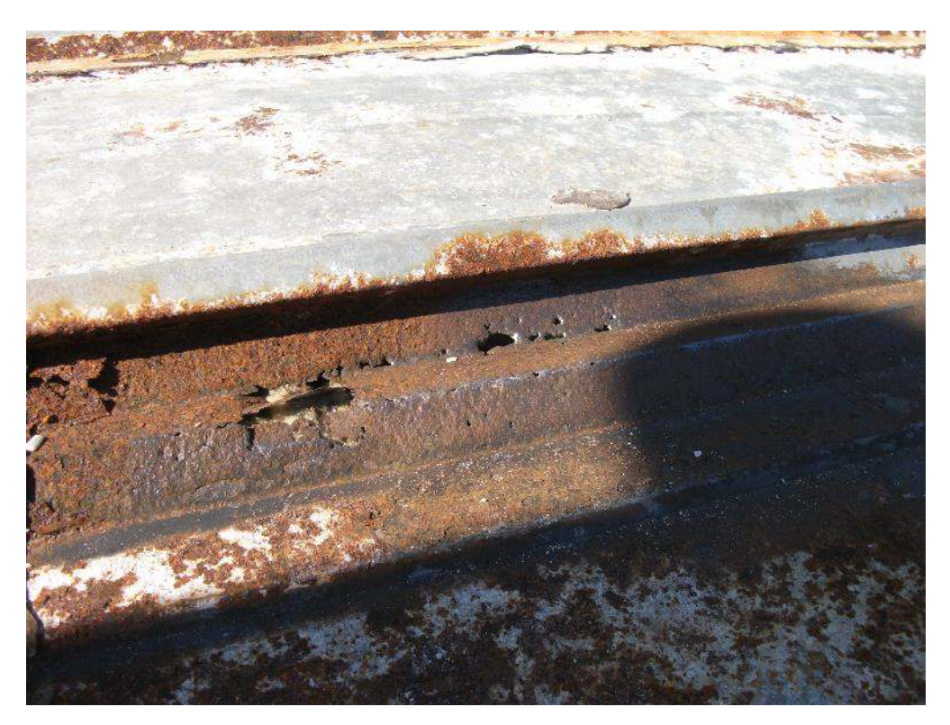
Photograph # 4: Holes in panel