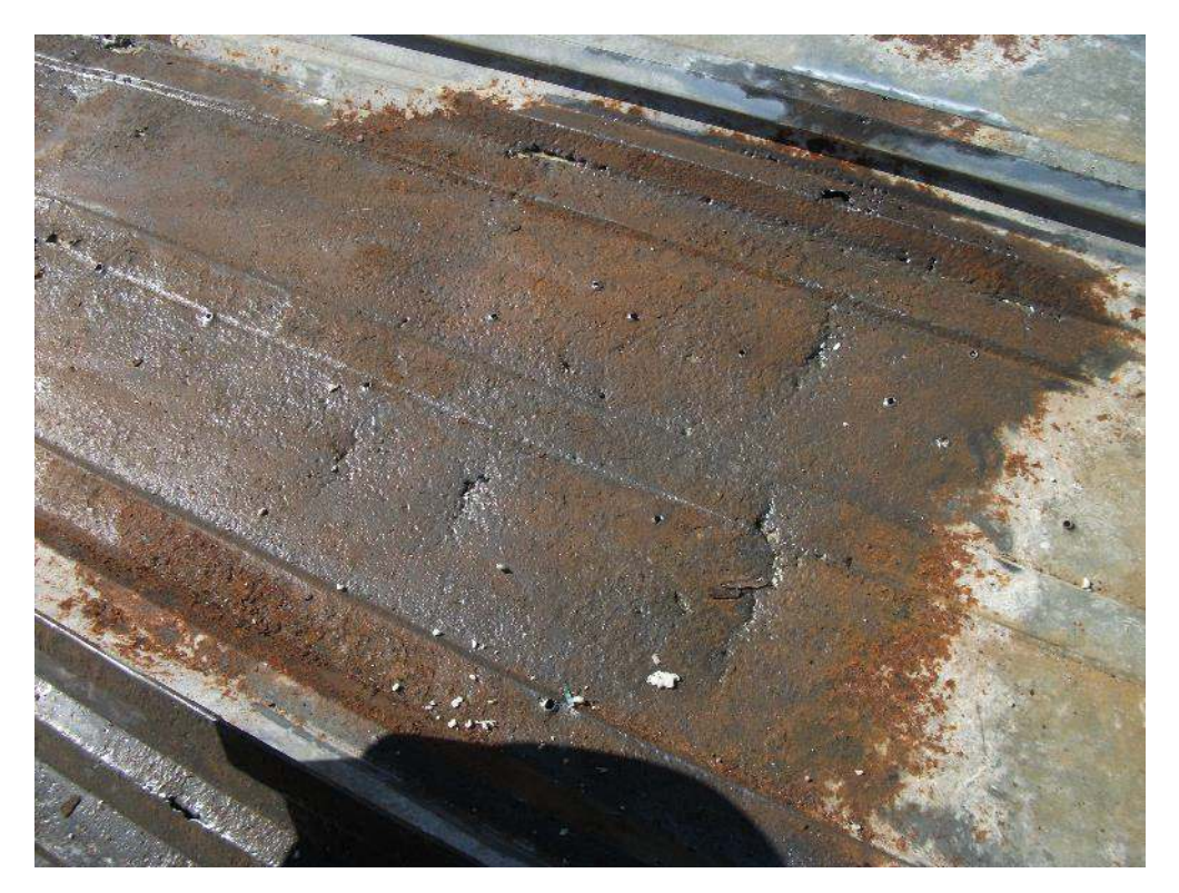
Photograph # 6: Metal is weak, numerous perforations