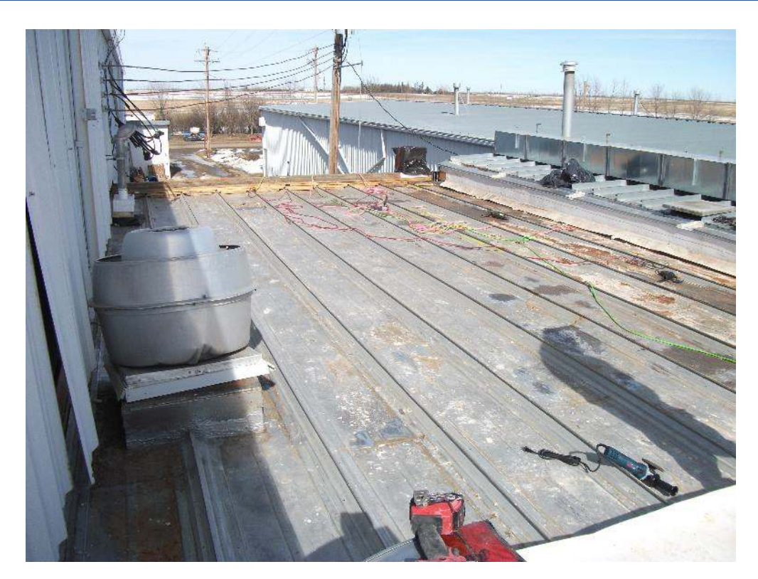
Photograph # 1: Overall view