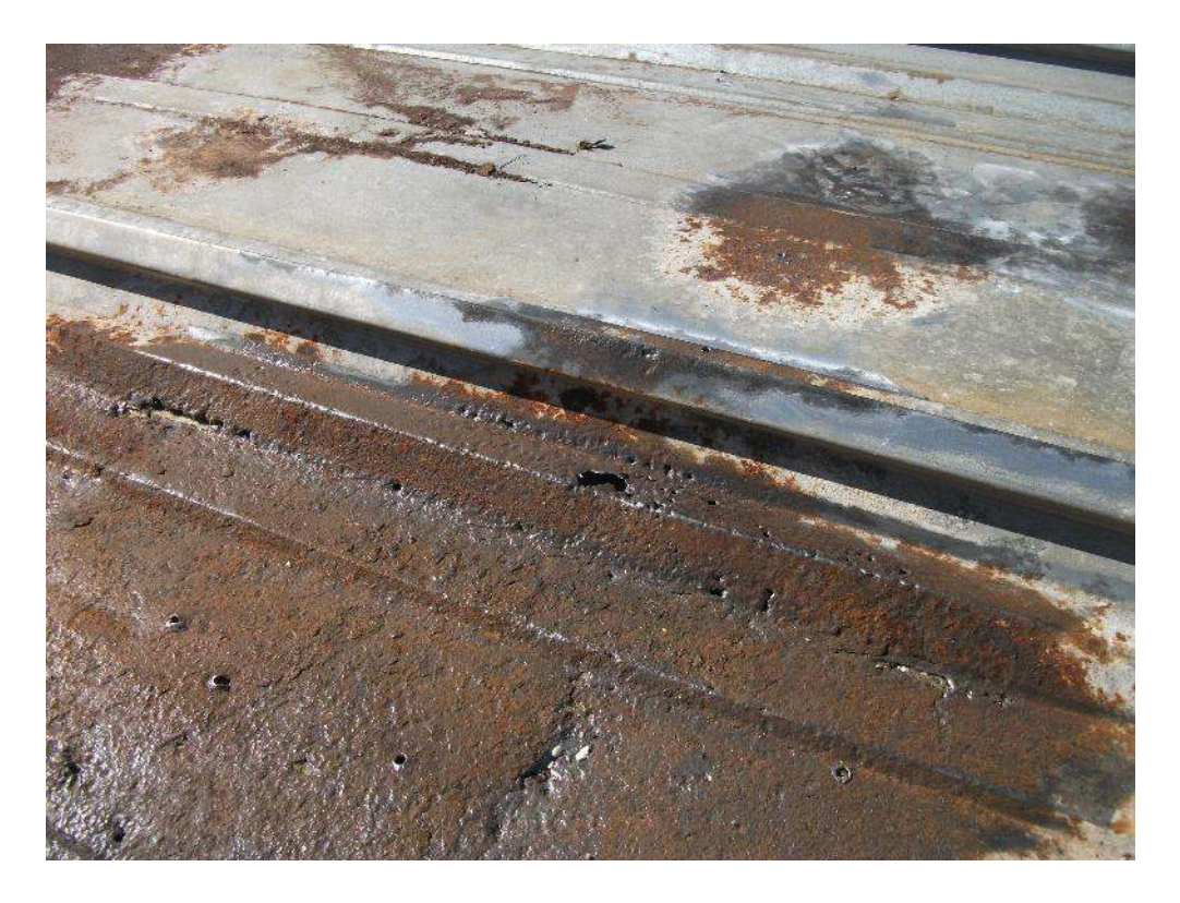
Photograph # 7: Holes