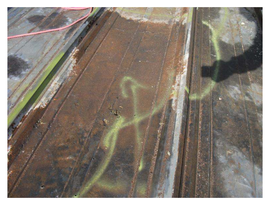
Photograph # 10: