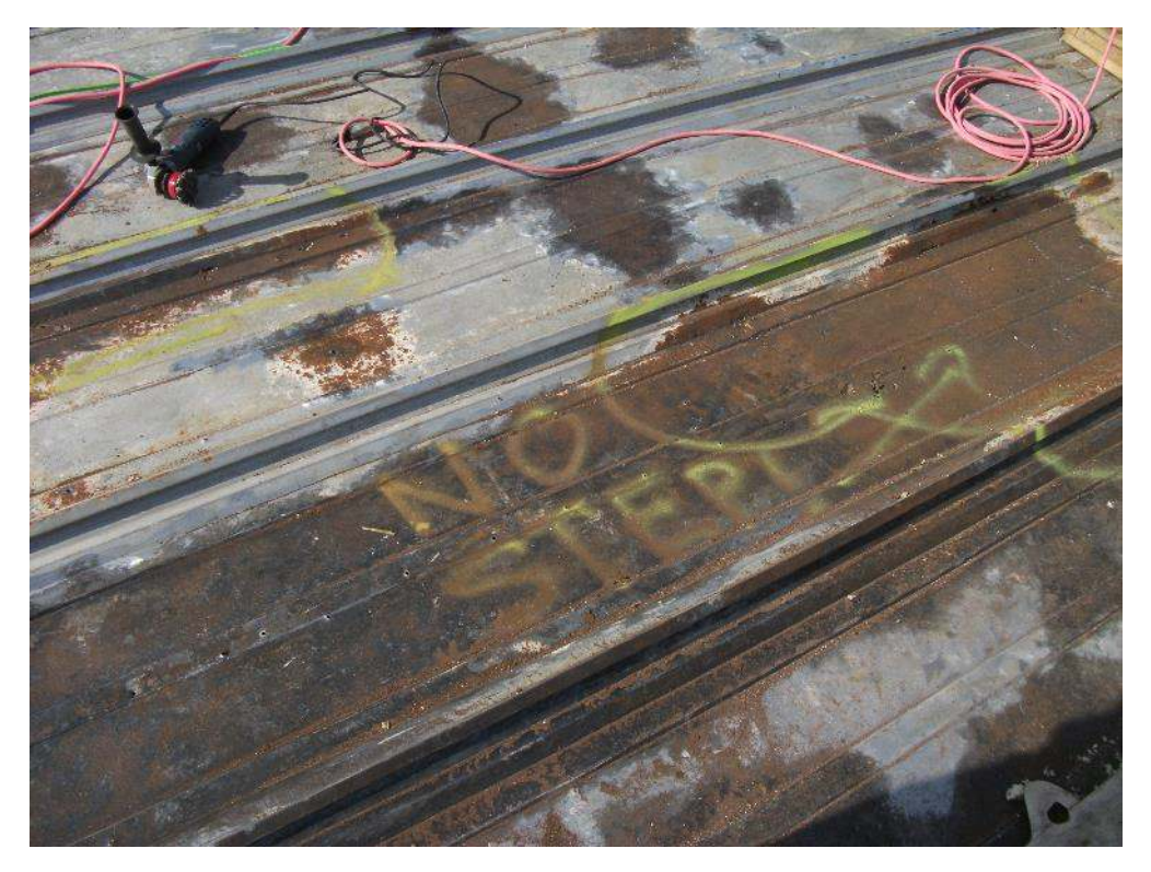
Photograph # 12: