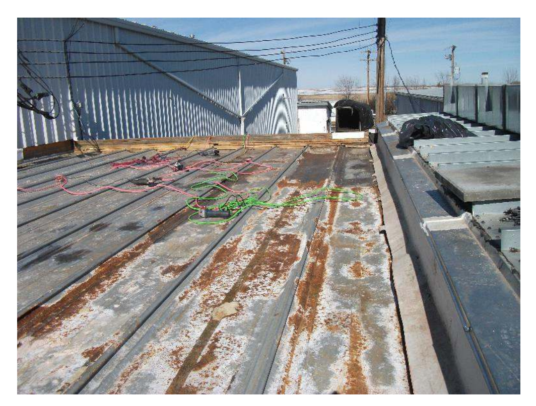
Photograph # 2: Overall view