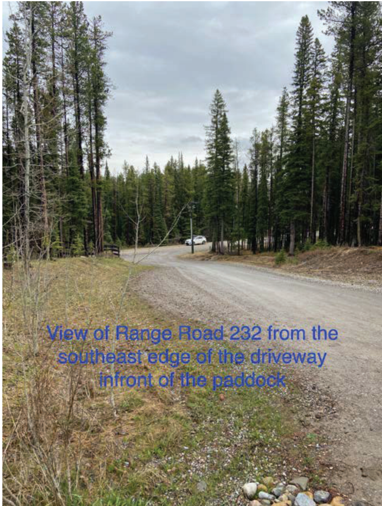
View of Range Road 232 from the southeast edge of the driveway infront of the paddock